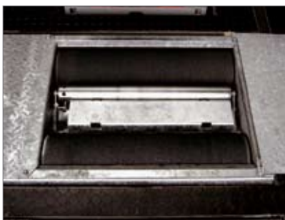
lifting- / lowering device

This additional feature avoids damage to vehicles, guarantees reliable results and saves you valuable time.