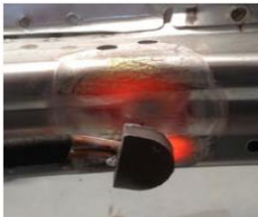
Side member heating (if not HSS)