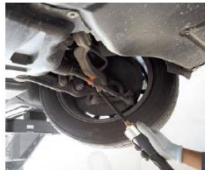
Releasing of steering linkage